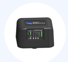
coDrive™ Control Unit