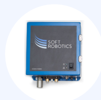
Soft Robotics Control Unit, Generation 2